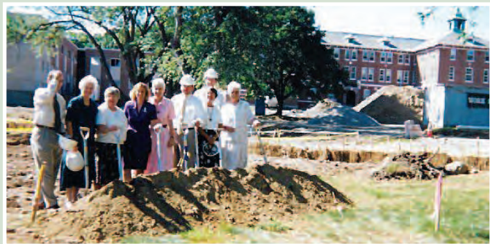
groundbreaking at du Lac

September marked the official 25th anniversary of Notre Dame du Lac Assisted Living Residence's opening to the community. The residents, senior leadership team, board members and special guests gathered under a tent in the du Lac courtyard on a balmy evening to commemorate the milestone.