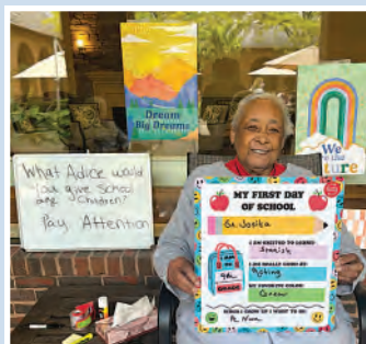
Back to School