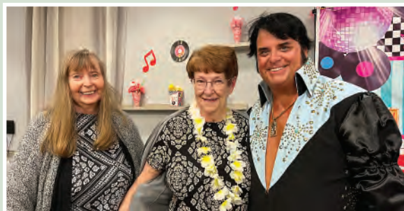
Elvis is in the House