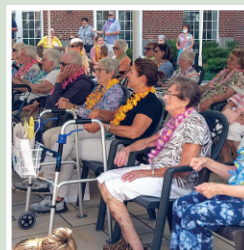
du Lac residents enjoy Family Fun Day