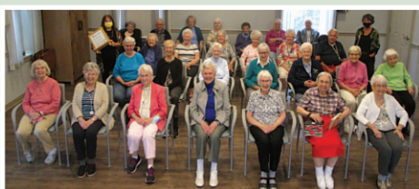
du Lac Assisted Living enjoyed a "Back to School" themed week that included a traditional classroom photo