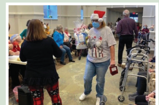
du Lac residents and families enjoyed the Annual Holiday Raffle on November 19