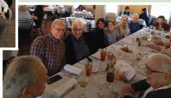
du Lac residents enjoyed a luncheon at Longfellow's Wayside Inn in Sudbury