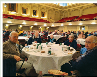
Residents enjoyed a brown bag lunch trip to Mechanics Hall

Our residents have enjoyed some great trips, entertainment and activities as the “new normal” continues. Some of these exciting trips and activities: a brown bag lunch to Mechanics Hall, a virtual wine tasting featuring Nashoba Valley Winery, Kentucky Derby Day, Olympic Events, Twinkle Tours and even some live music for St. Patrick's Day. It has truly been a blessing to witness all the smiles and laughter throughout the community. Looking ahead to the rest of the year we are looking forward to Family Fun Day, enjoying our courtyards in the nice weather, and more trips out and about!