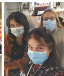
Sisters, Residents, and Staff enjoying the 2021 Ed Forum